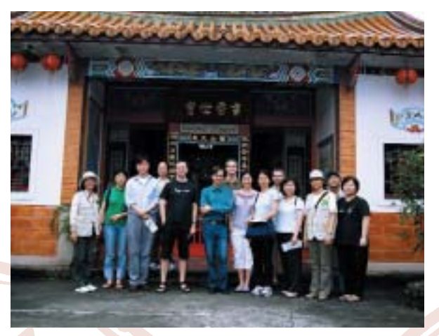
CCS visiting scholars pose for a group picture at Chen Family Jianhutang